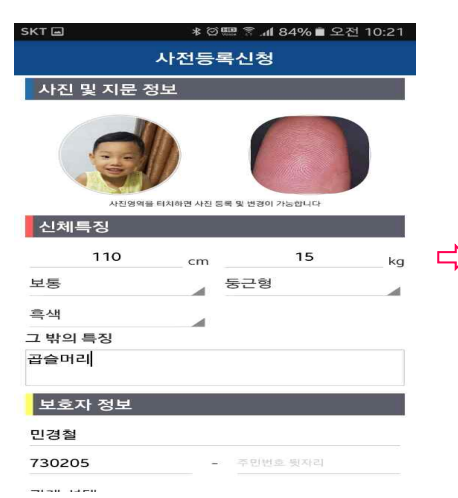
Registration of physical features