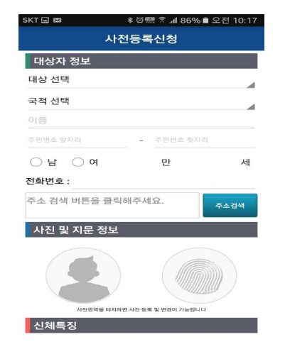
Register for Pre-registration