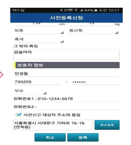
Registrer Guardian's Information